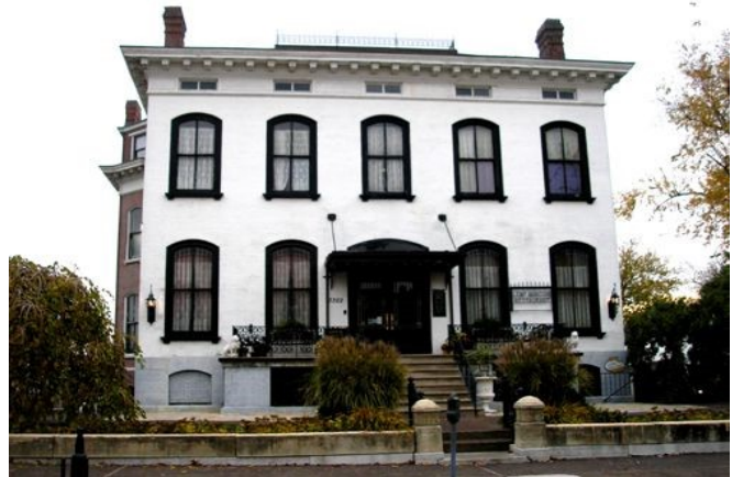
The haunted Lemp Mansion in St. Louis